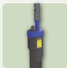
TOOL HOLDER FOR PLUTO INLINE