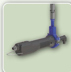
TOOL HOLDER FOR PLUTO WITH ANGLE HEAD