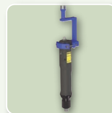
UNIVERSAL TOOL HOLDER FOR ANY SCREWDRIVER